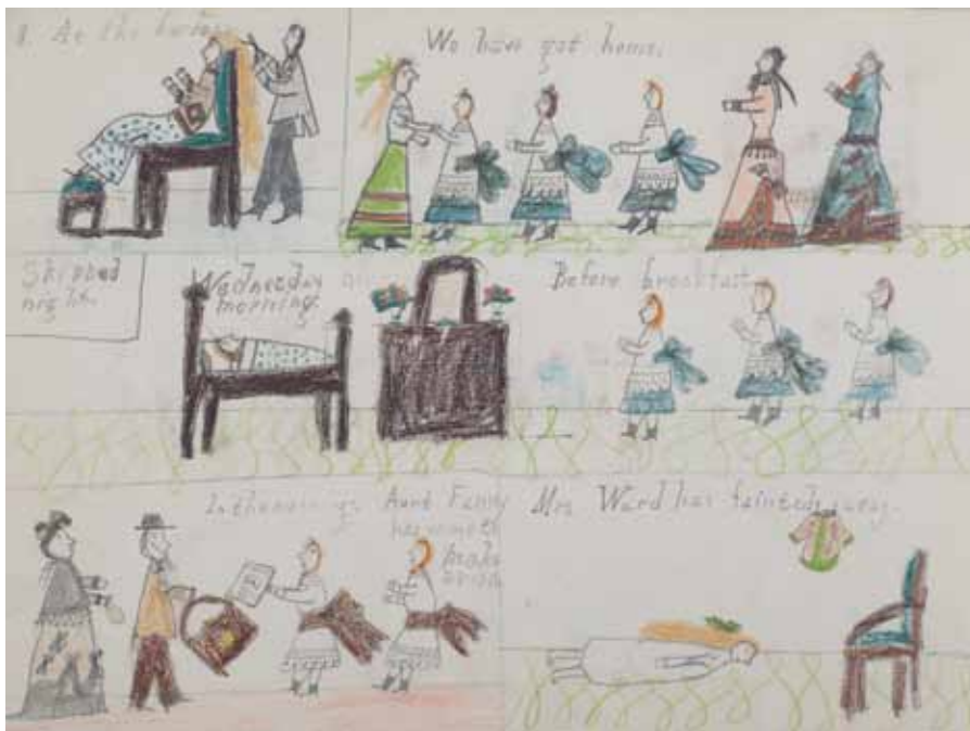
Detail from Bertha Louise Cogswell drawing books, volume 3, ca. 1876–1880. Collections of the MHS.

Smith detail his service with the Twenty-Fifth Massachusetts Infantry Regiment from 1861 to 1865, complete with extensive descriptions of the Battles of New Bern and Cold Harbor.