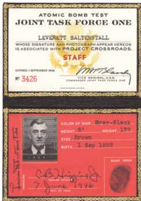
Identification of Leverett Saltonstall for Project Crossroads, Atomic Bomb Test Joint Task Force 1.

The fall of 2010 brought to completion another new MHS website, The Siege of Bos-